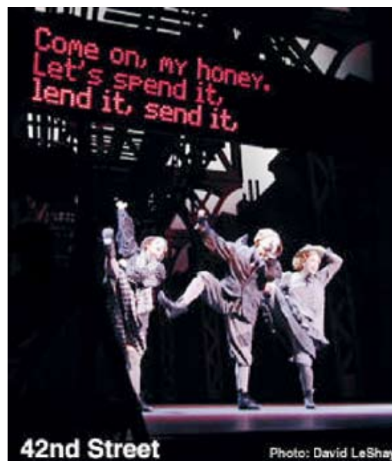
Fig. 3: Open Captioning of a performance.

tours provide visual description of the artwork or animals.