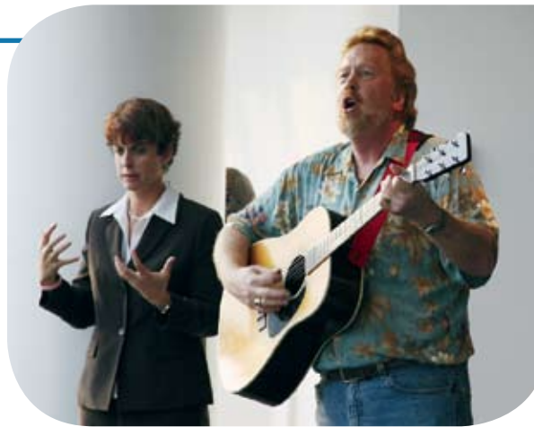
Fig. 1: An American Sign Language interpreter signs a musical performance.

Sunshine State Standards: LA.6.1.6.2, LA.7.1.6.2, LA8.5.2.1, LA.8.5.2.2, LA.8.5.2.3